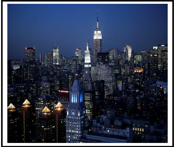
Adequate black start resources are critical to New York City reliability.

burden. The NYSRC also adopted revised testing rules that applied mainly to large steam electric units. Finally, the NYISO introduced a new payment schedule. New system restoration procedures that were adopted in 2013 by Con Edison compensated for the potential reliability impact when the three black start units left the program in 2011.